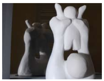
The Portland Square Memorial