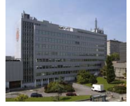
The Cookworthy Building (above) The Davy Building (above right)