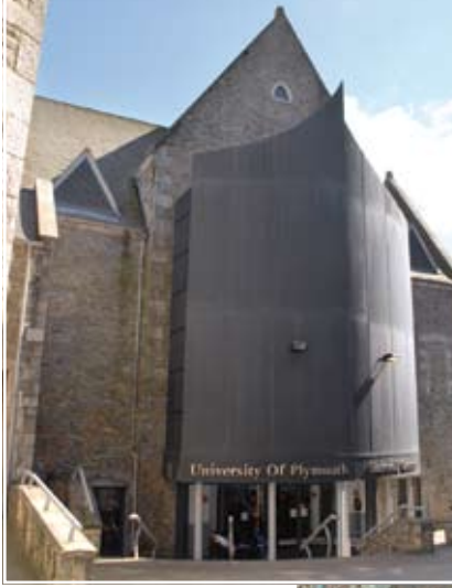
The Sherwell Centre (above) Chaplaincy (right)