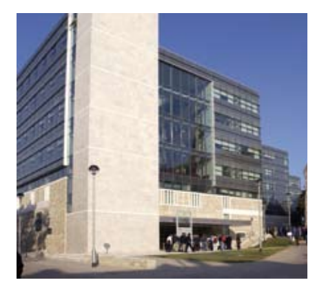
The Portland Square Building